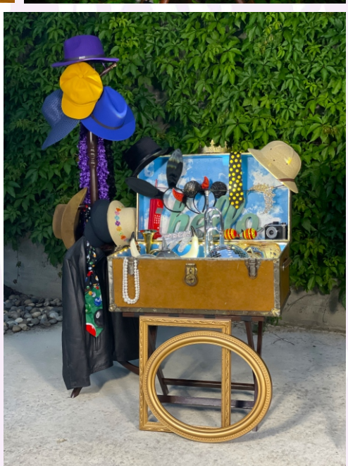
Carmel / Monterey Bay area's BEST Wedding and Event Vintage Photo Booth!